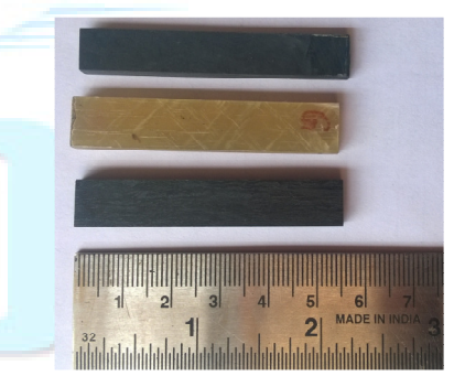
Fig. 1: Specimens used in SBS testing

The short beam shear test subjects a beam to bending, the beam is very short relative to its thickness. For example, ASTM D 2344 specifies a support-spanlength-to-specimen-thickness ratio (s/t) of only 6:1. The objective is to minimize the flexural (tensile and compressive) stresses and to maximize the induced shear stress. The specimen and specimen testing configuration are shown in the Fig. 1 and Fig 2. respectively.